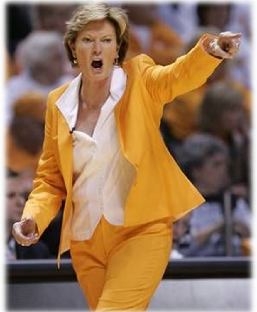
Pat Summitt, deceased Tennessee Vols, Womens' Basketball Coach